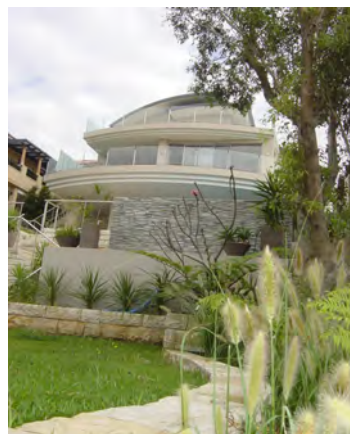
Seaforth House – terraces to Harbour view and wet edge pool