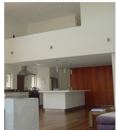
Harboard House entertaining areas – void over living and dining