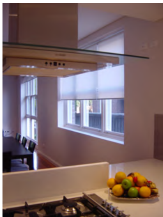
Woolahara apartment kitchen