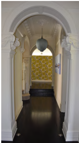
Balmoral Slopes House – formal entry hall and eat in kitchen