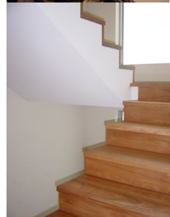
Seaforth House – int stair