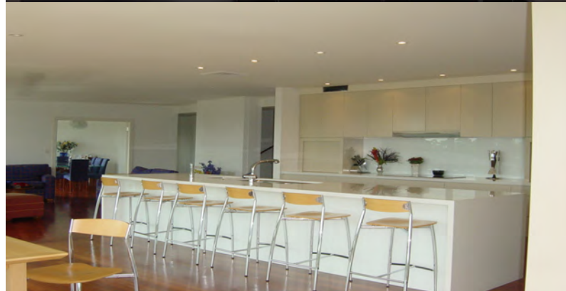
Narraweena eat in kitchen for six